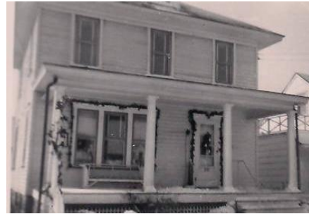
335 Independence Ave. Trenton, NJ