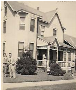
121 Park Avenue, Trenton, NJ

Following the end of the war, Dad and Mother purchased a home in 1946 after renting from others for the previous fifteen years. They moved from 121 Park Avenue in Trenton to 335 Independence Avenue, just a few blocks away.