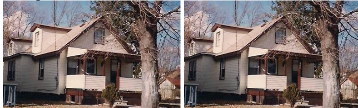
121 Linden Ave. Pleasantville, NJ