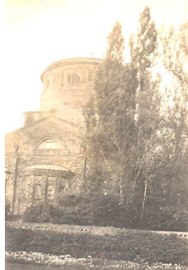
Cemetery building in Frankfurt