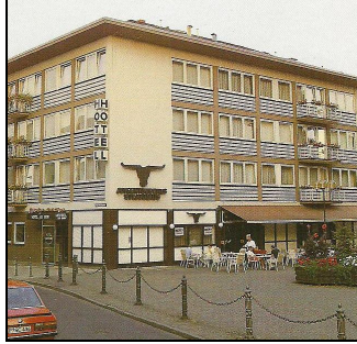
Hotel Dom next to Cathedral