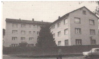
Bierstadter Hotel – Wiesbaden Peter Schreiner and family

Disappointed, we walked through the shopping area, but shops are all closed on Sundays in Germany, so back to the car we went, and back to the hotel.