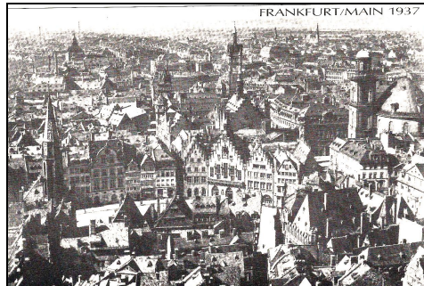
Frankfurt Romerberg Square before WW II

While Isabel took a nap, I walked to the Romerberg square where the Heiligeshift Christmas Festival was taking place. Numerous tented stands filled the square selling food, drinks, crafts, toys, etc. Children were taking rides on the merry-go-round as I pressed close to the raised platform where a children’s choir presented Christmas songs.